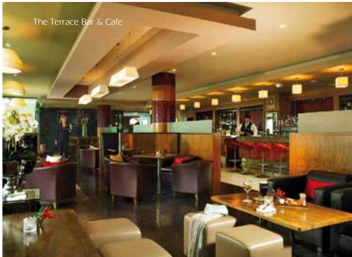
The Terrace Bar & Cafe