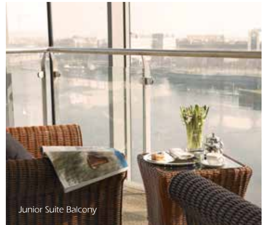
Junior Suite Balcony