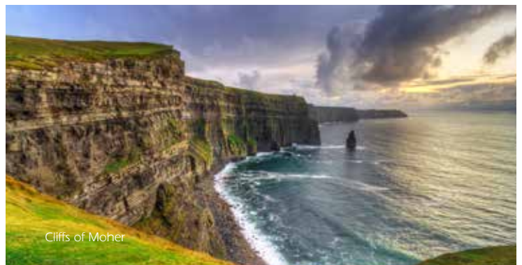
Cliffs of Moher

King John's Castle Cliffs of Moher Limerick Milk Market City Centre Shopping Fantastic Nightlife Frank McCourt Museum The Hunt Museum Thomond Park Foynes Flying Boat Museum