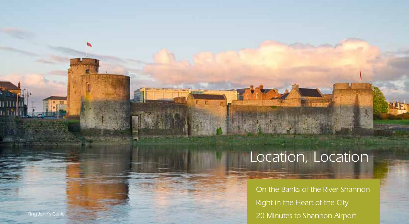
King John's Castle