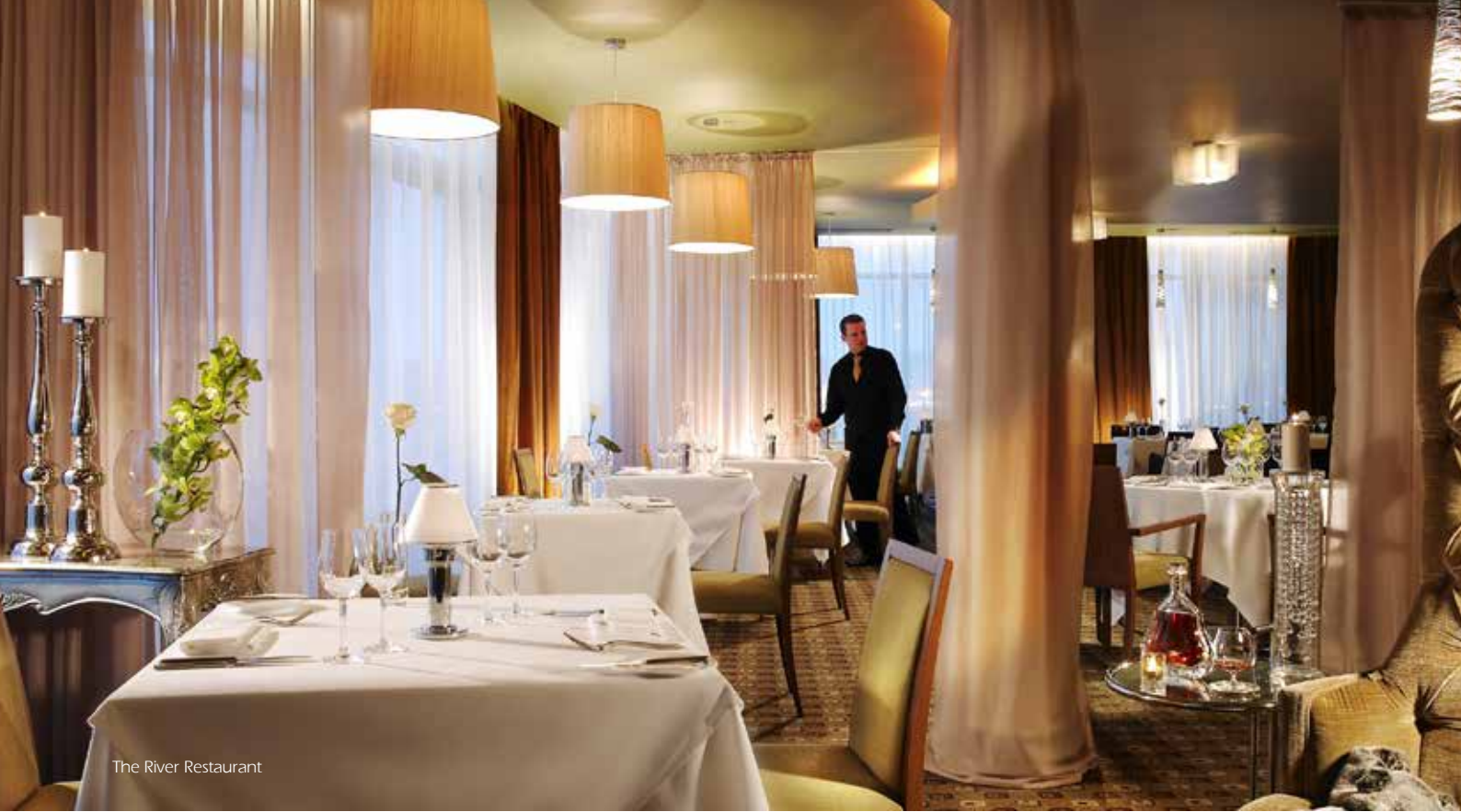
The River Restaurant