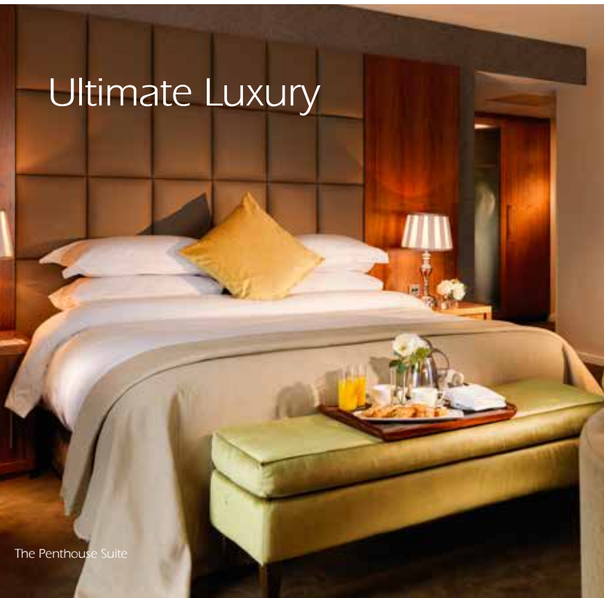
The Penthouse Suite