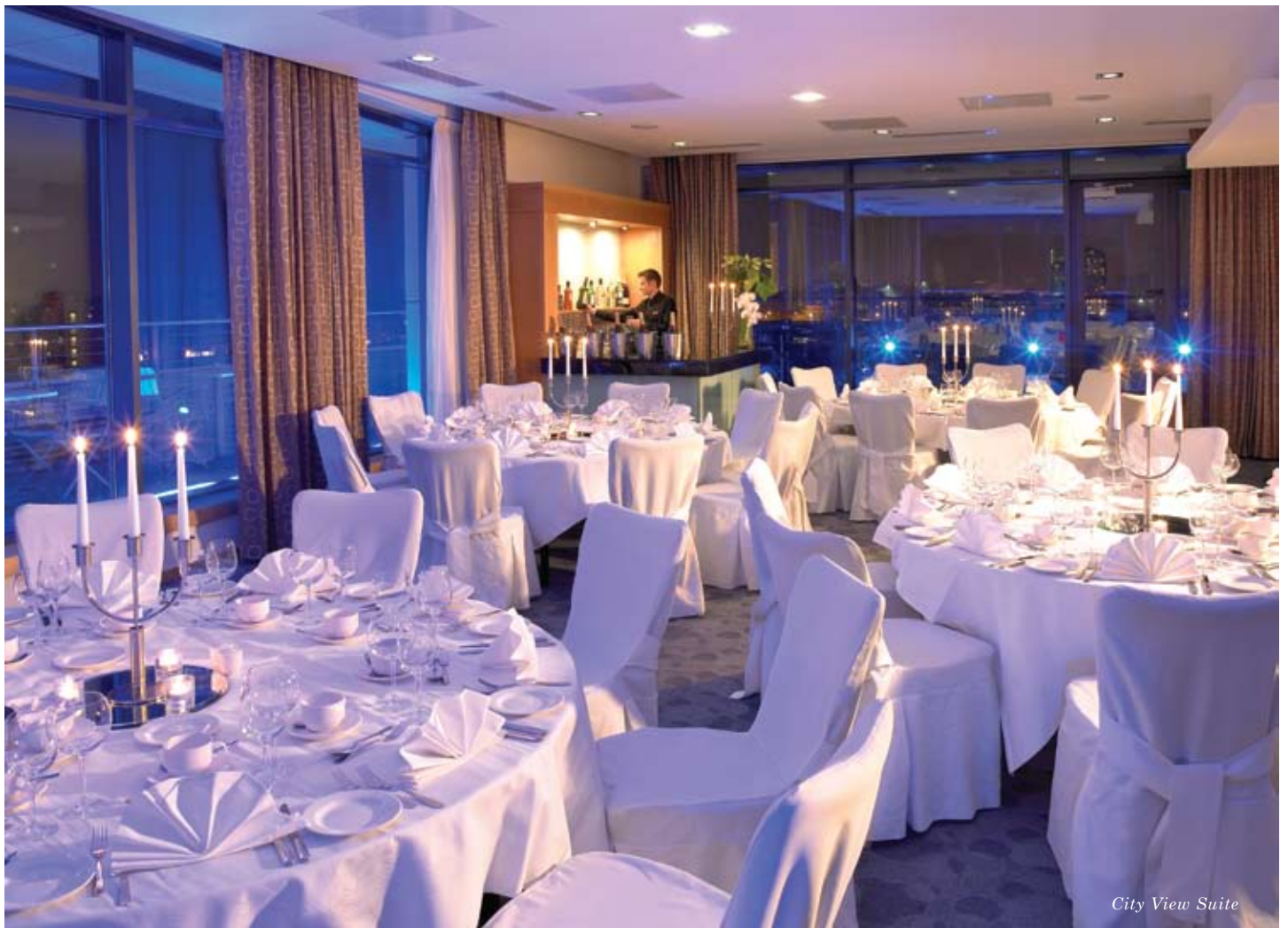
City View Suite