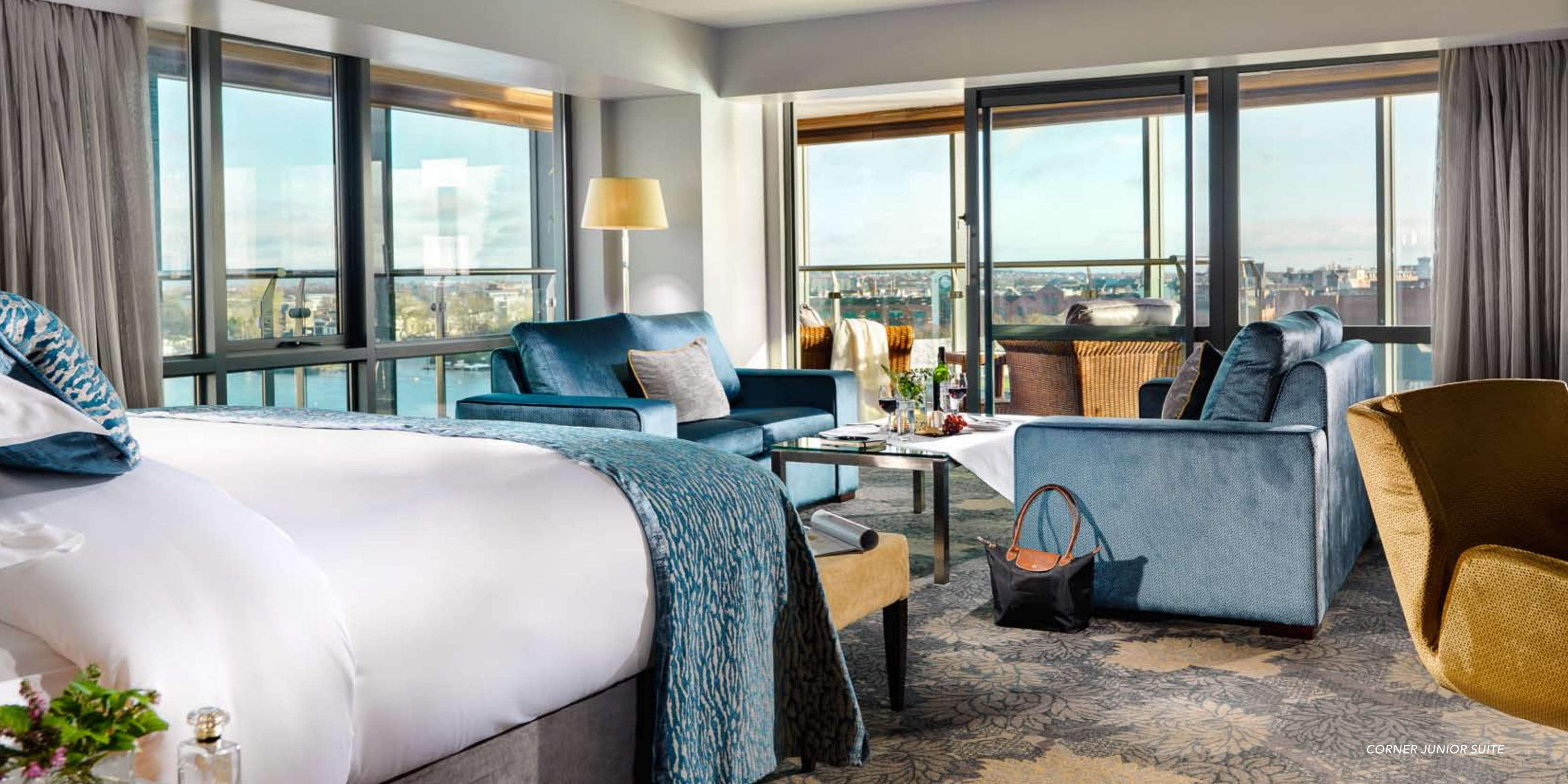
CORNER JUNIOR SUITE