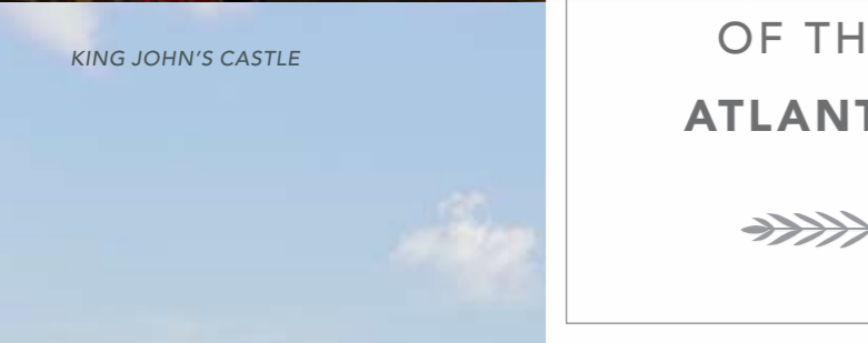
KING JOHN'S CASTLE