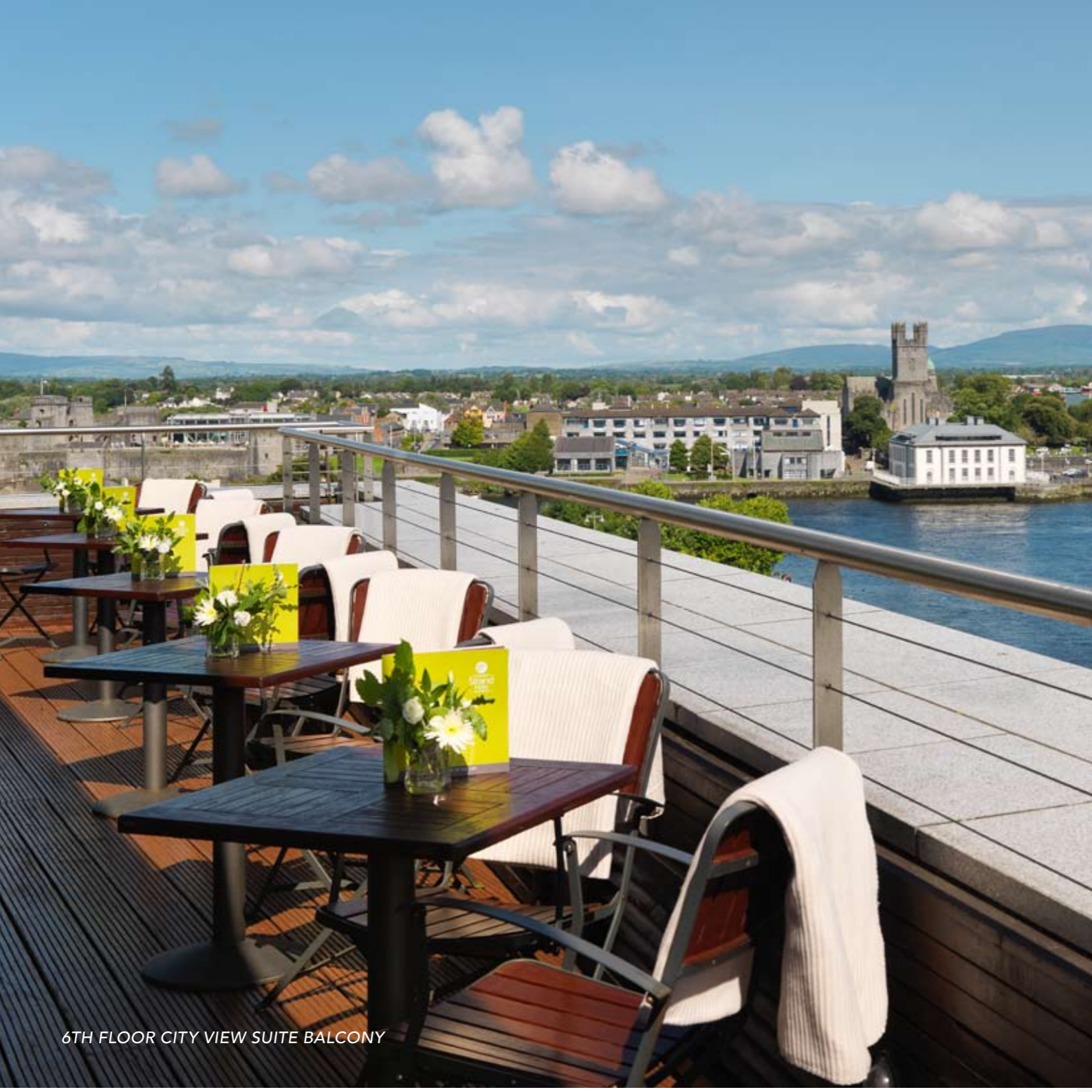
6TH FLOOR CITY VIEW SUITE BALCONY