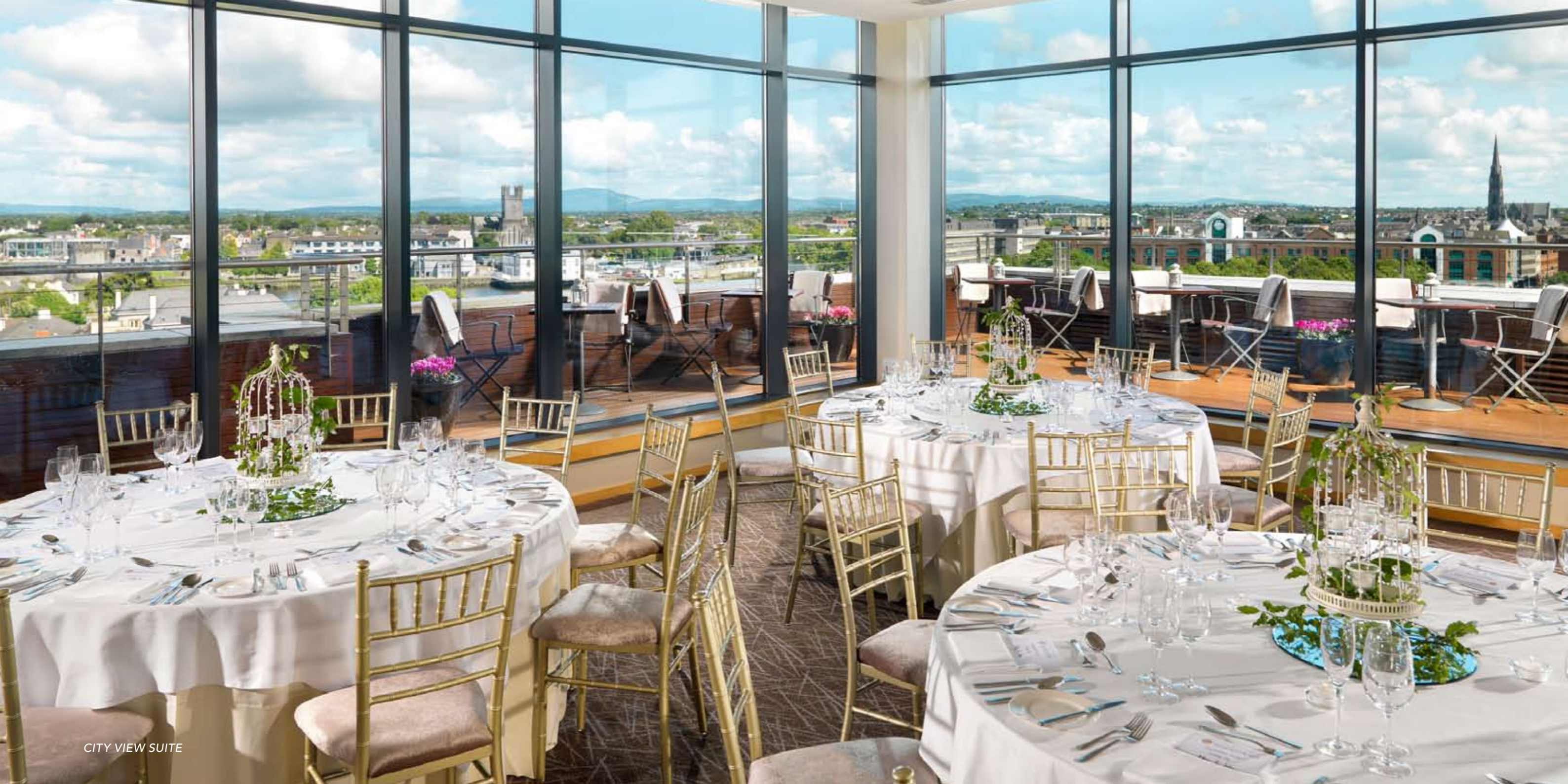
CITY VIEW SUITE